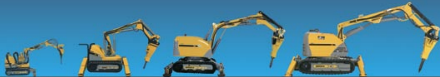
The Brokk Family